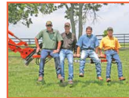
850 lbs of weight is no match for the LimbSaw's solid-steel frame